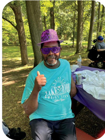
80s Day at Camp

20+ individuals received larger state waivers to give them access to more needed services - all thanks to our Options team's hard work!