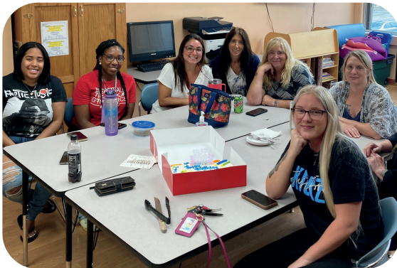
Our Project First Step Team