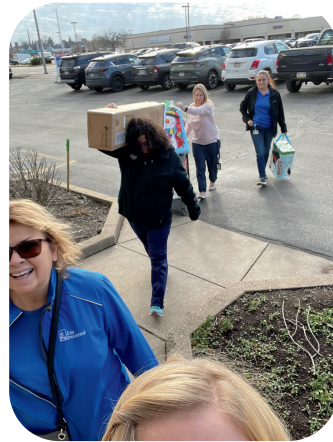
Erie Insurance employees collected Christmas gifts for PFS families