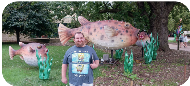
Trip to Buffalo