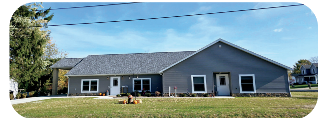
Knoll Rd Home