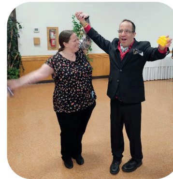
Night to Shine