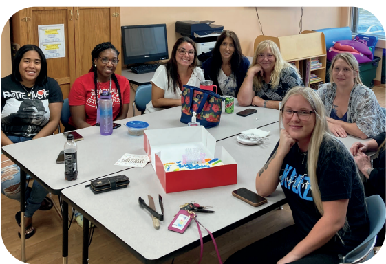
Our Project First Step Team

Erie Insurance employees collected Christmas gifts for PFS families