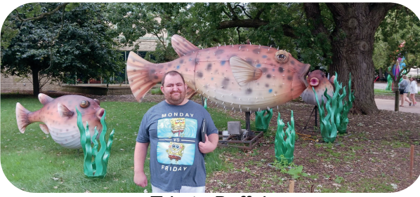
Trip to Buffalo

20+ individuals received larger state waivers to give them access to more needed services - all thanks to our Options team's hard work!