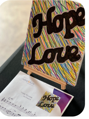
Unspoken Symphony art piece