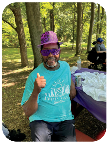
80s Day at Camp