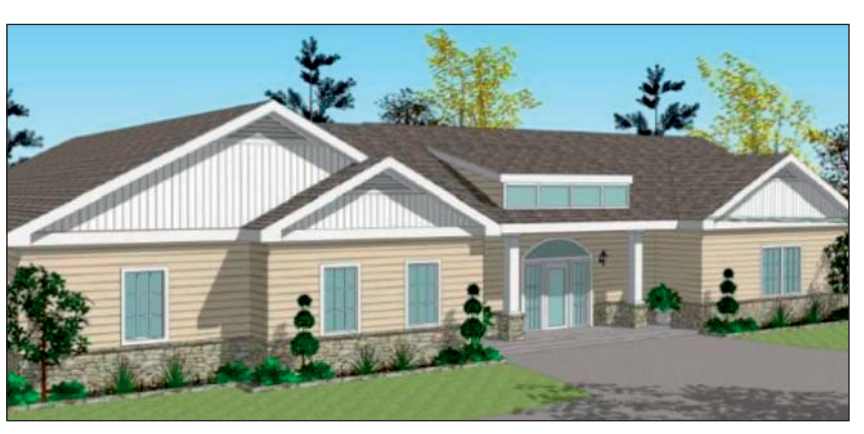
Architectural rendering of the medically equipped homes.

As of June 30, 2017, dozens of individuals, corporations and foundations had pledged or donated to the campaign. This is the largest campaign goal in EHCA's 105-year history.